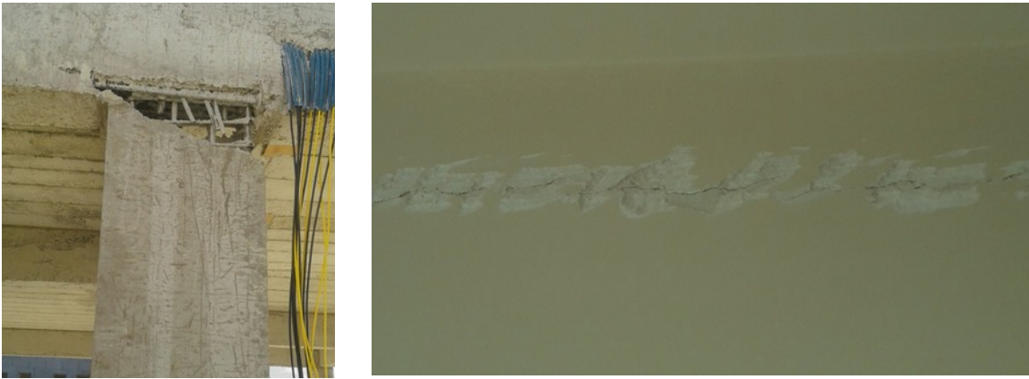
Image 4: New housing columns and walls in New-Hasankeyf in bad condition