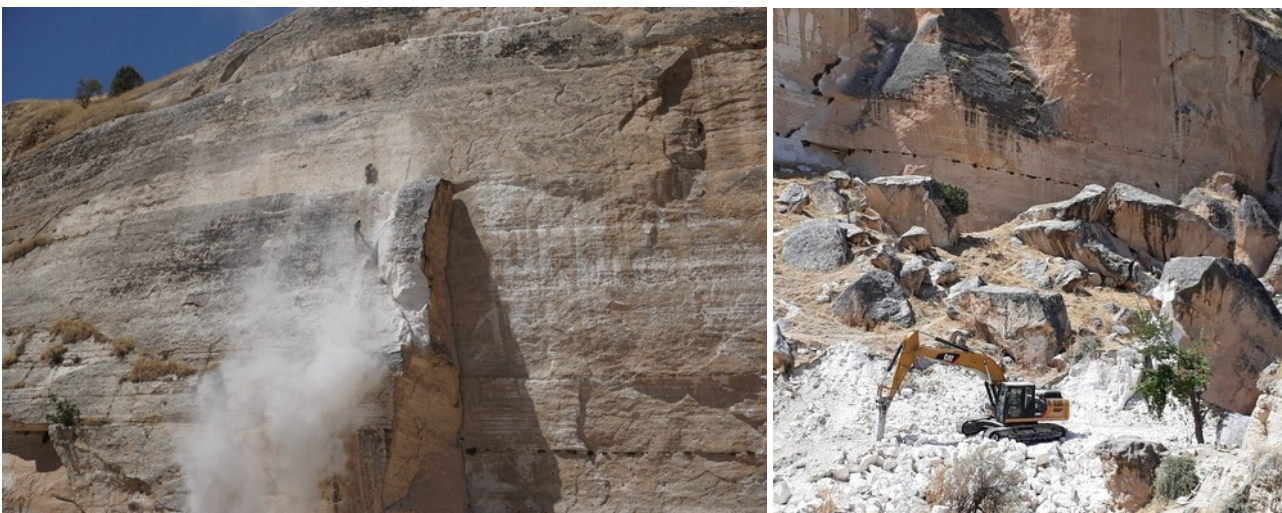
Image 6: Destruction of one rocks piece in mid of August 2017; Heavy equipment working with debris

Another scandal in this regard is that only several days after the destruction of rocks an officially required permission was issued (on 15.08.2017) by the Regional Board on the Conservation of Cultural Assets. So at least some of the rock demolitions were illegal. In the first days of September 2017, construction companies started to work with the debris from rock destruction.