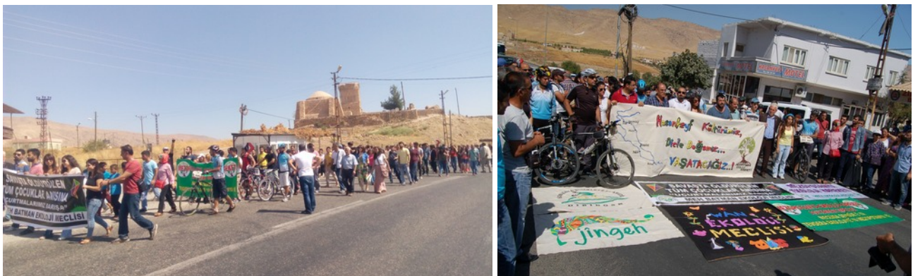
Image 7: 1st Global Hasankeyf Action Day, 20.09.2015, Hasankeyf

In 2015, the recently organized Mesopotamian Ecology Movement, a broad movement of ecological oriented activists and organizations in Turkish-Kurdistan, joined the campaign against the Ilisu Project. In 2015 only, more than five demonstrations were organized together with the HYG, two of them in Dargecit, the town next to the dam site. On September 20, 2015 the 1 st Global Hasankeyf Action day was organized. 11 The 2 nd Global Action Day will take place on September 23, 2017.