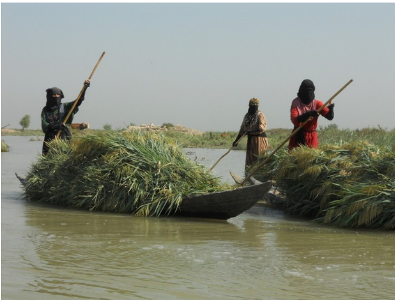
Image 2: Marsh Arabs in the South Iraqi Marshes; source: Save the Tigris and Iraqi Marshes Campaign

The Ilisu Project is a large intervention into the geography of Upper Mesopotamia and would flood 400 km of precious riverine habitat which is home for many species like the endangered Euphrates Soft-shelled Turtle. The river stretches are very crucial for the whole ecology of the region. The regional climate would also change as happened with the Euphrates River Basin where the traditional agriculture experienced some serious negative impacts due to four large dams. As only some research has been done in the Tigris Valley up to the present time we do not know really what would be lost. The water quality of the reservoir is expected to be extremely low, leading to massive fish extermination, and threatening people's health. Further downstream the decreased water flow will have a negative effect upon the Mesopotamian Marshes in Iraq – one of the most important ecosystems worldwide and recently proposed by the Iraqi government as a UNESCO World Heritage Site.