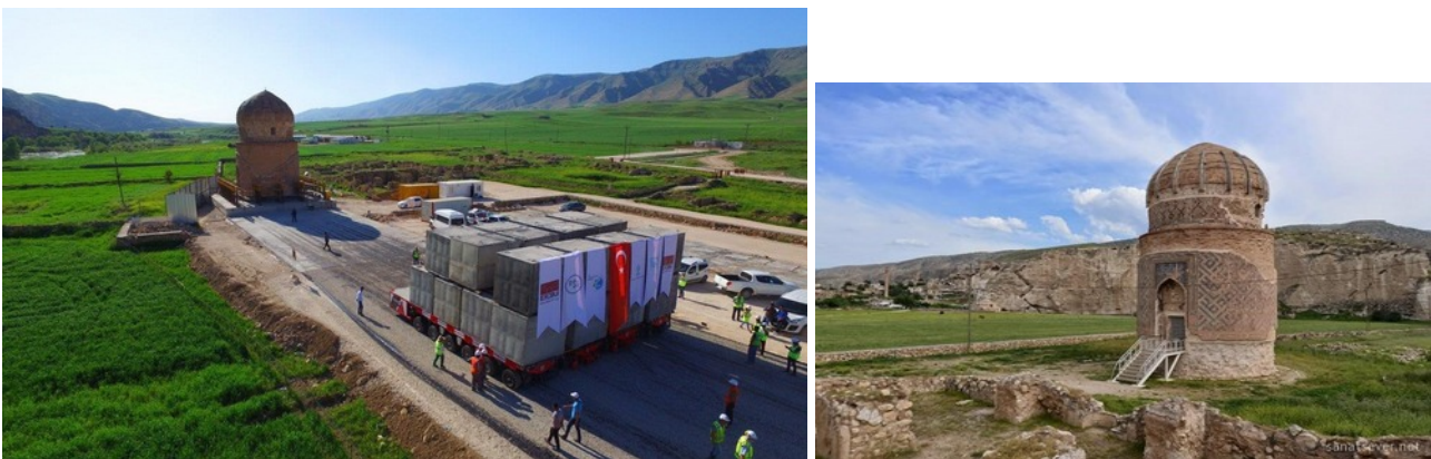
Image 5: Zeynel Bey Tomb during relocation in May 2017; before the relocation

According to DSI, in total nine monuments are planned to be relocated to the planned ‘Hasankeyf Cultural Park’. The preparation for the relocation of the first one, the Zeynel Bey Tomb, started in 2015. The whole process of the relocation was hidden from the public and had no participation by stakeholders, violating existing laws, particularly the tendering and contracting process. With the participation of the Dutch company Bresser Eurasia, the Turkish Er-Bu Insaat could finally relocate the Zeynel Bey Tomb on May 12, 2017. Considering that there is globally no similar relocation experience of a monument of such an age (550 years old) with binding agent technology and the monument is very fragile and in poor condition (there are splits in the cupola) it was a very risky action. People in Hasankeyf stated days later that there was an increase of cracks at the surface; but as no independent experts could examine the monument it is unclear what the result is.